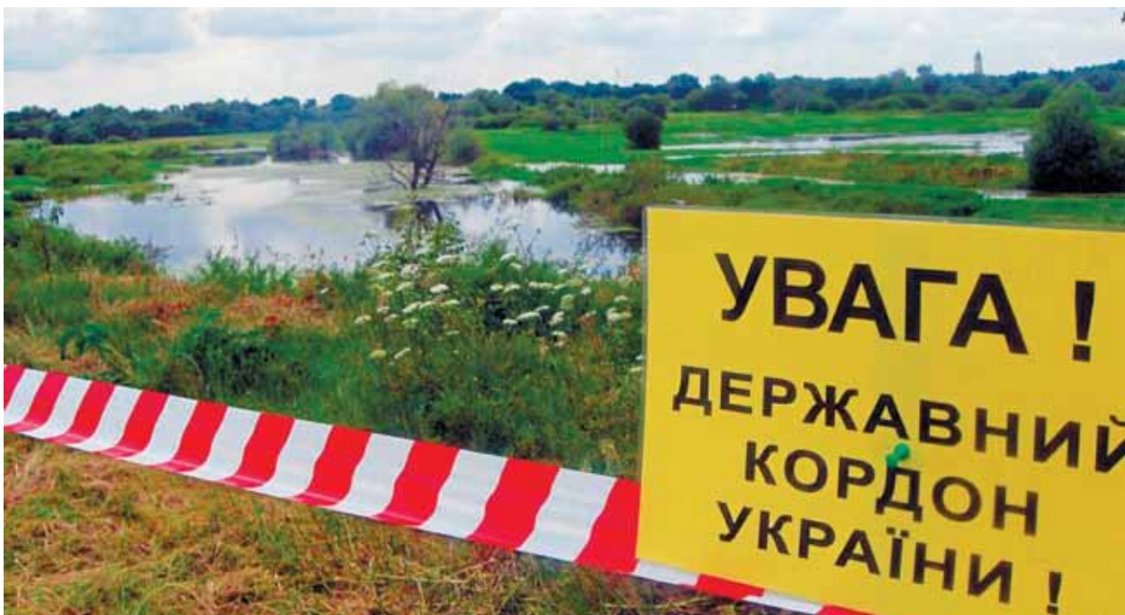
Rivers, lakes and dense forests make it difficult to control the border between Ukraine and Belarus

* The regional project titled, "Strengthening Surveillance and Bilateral Coordination Capacity along the Common Border between Belarus and Ukraine (SURCAP Phase II)", is to be carried out over 30 months (2014–2016). It is funded by the European Union and implemented by IOM with the support of ICMPD. The project's budget for the two countries is EUR 5.3 million.