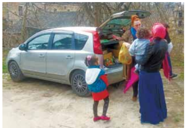
Crimean Tatar families in Khmelnytskyi receiving some clothes, shoes, food and medicine from local volunteers