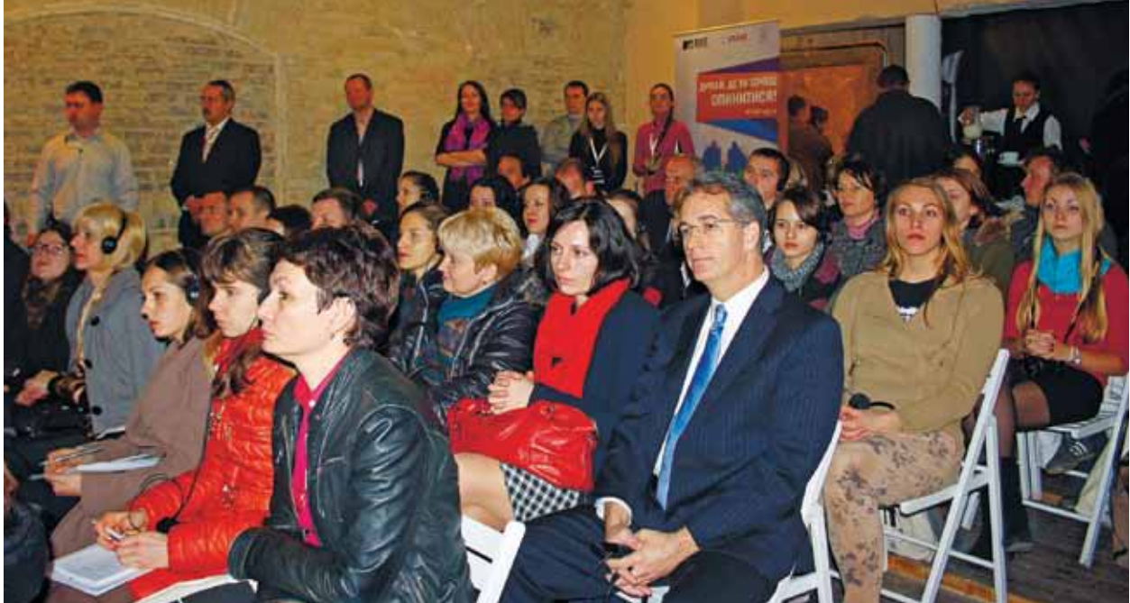
The documentary's premier was attended by many Ukrainian journalists, youth activists, and representatives of the diplomatic community (in the foreground is William Henderson, Head of the Law Enforcement Section at the U.S. Embassy)

make up 42 per cent of all victims of trafficking whom the IOM Mission in Ukraine assisted in 2000–2012.