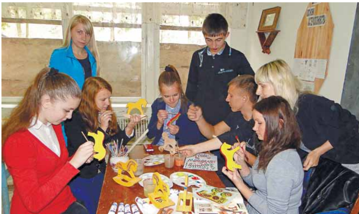
Local youth at a crafts training

SWISS CONFEDERATION AND IOM HELP TO REVIVE TRADITIONAL ARTS AND CREATE JOBS IN YAVORIV DISTRICT