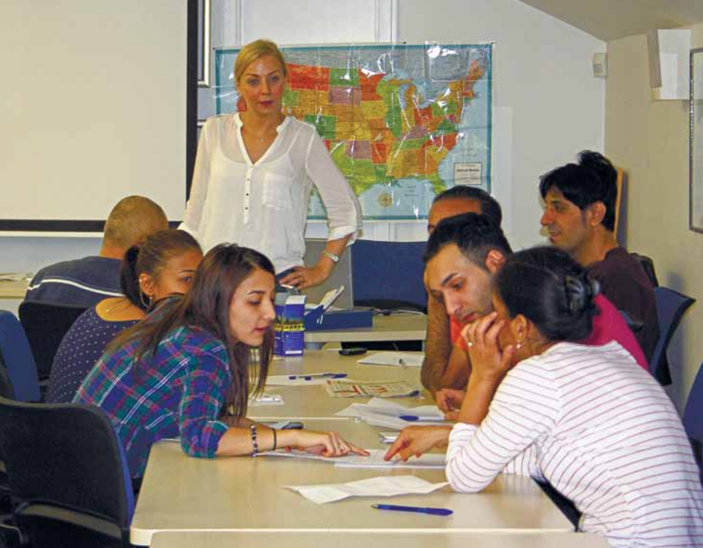
The participants of the USRAP cultural orientation session at IOM are fully engaged in learning about their new life in the U.S.