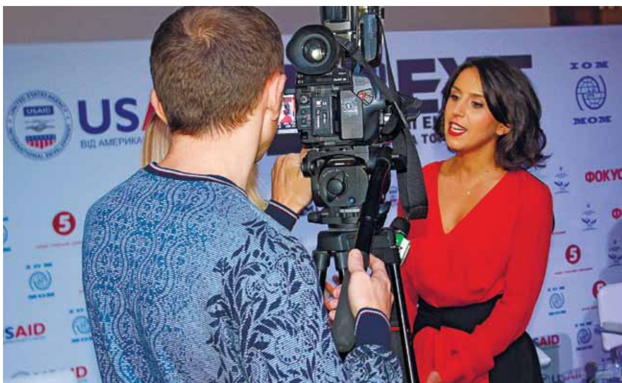
Famous Ukrainian singer Jamala has become an MTV Counter-Trafficking Goodwill Ambassador