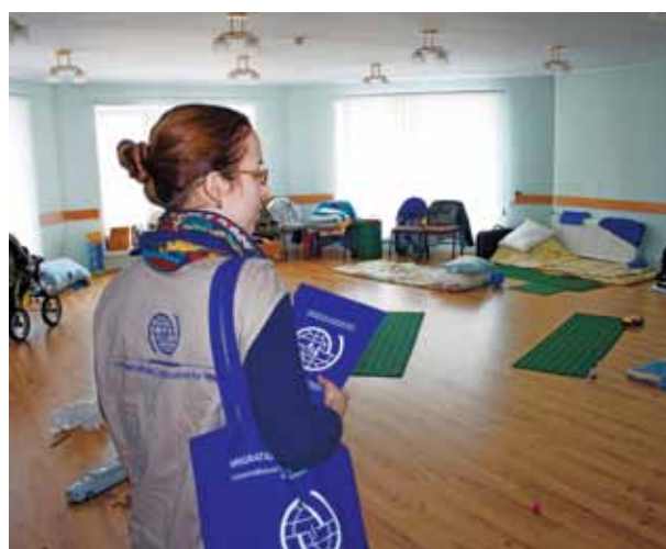
IOM staff monitors accommodation conditions for displaced persons in Vinnytsia