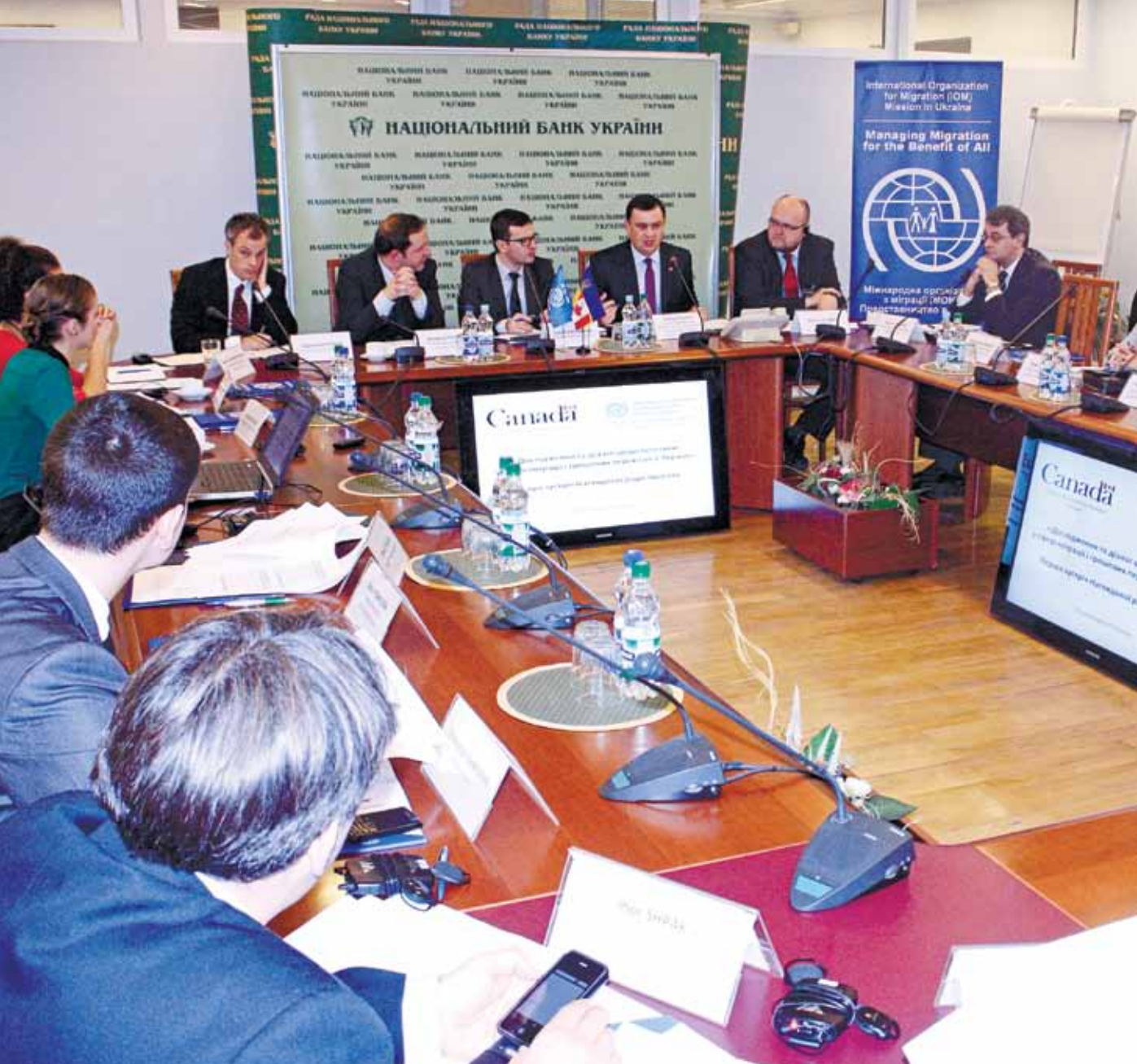
Ukrainian and international experts actively engaged in discussing the remittances research methodology

“Up to now there has been no reliable research on remittances sent home by Ukrainian migrants. Therefore, I hope that this project will ensure a comprehensive and reliable research, which will help to develop policies based on the experience of cooperation with Ukrainian migrants and to engage migrant remittances for Ukraine’s economy.”