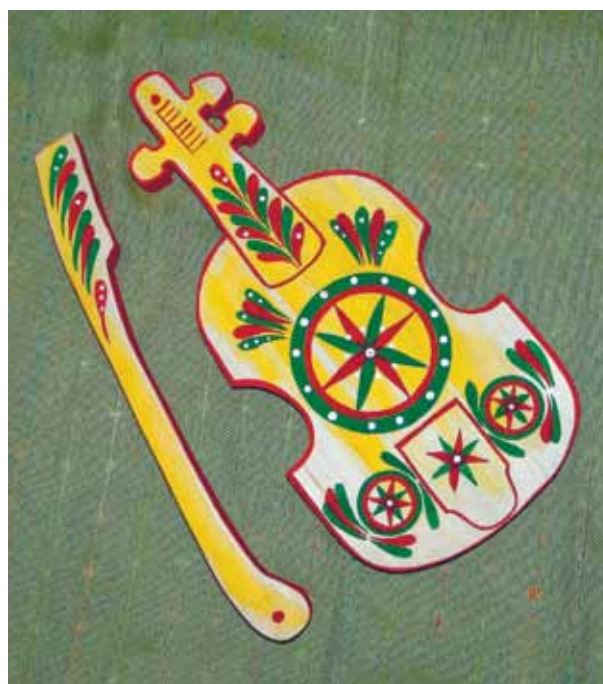
Yavoriv-style toy violin

The local NGO “Union of Yavoriv Ethnographers ‘Hostynets’” does research and promotional work. In the framework of the Swiss-funded IOM project, a training centre for craftspeople named “Mastak” was opened on its premises to spur the production of traditional souvenirs.