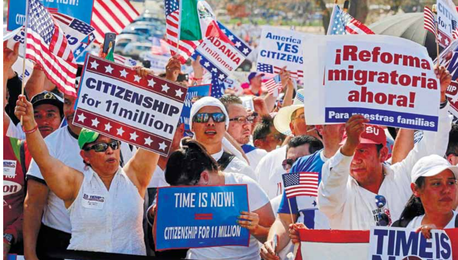
A protest in favour of comprehensive immigration reform, Washington, April 2013

though the immigrants that would receive amnesty cannot vote, immigration reform is an issue that the broader Hispanic population, including voting citizens support. Immigration comes up every day on the news of the Spanish language TV channels and other media, and this helps move public debate. In 2012, during the U.S. presidential election, President Obama, who had a very specific policy about a legalization programme, was very clear in communicating that, and his opponent was very clear about not having a legalization programme. Ultimately, President Obama won the overwhelming majority of the Hispanic vote, 71 per cent to his competitor Mitt Romney's 27 per cent.