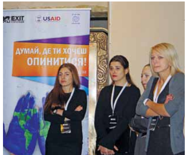
Some scenes of the movie really shocked the audience

“According to our research, over 120,000 Ukrainians have become victims of human trafficking since 1991. We as IOM are proud to have provided over 10,000 victims of trafficking