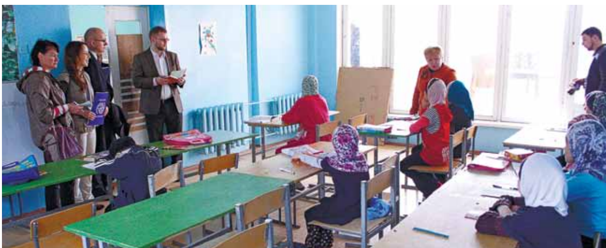
IOM and UNHCR colleagues visit a Ukrainian language class organized at a Vinnytsia sanatorium for displaced children from Crimea

An evangelical church in Vinnytsia has been hosting several Crimean Tatar families since they first began to arrive to the city. The church has allocated premises in the biblical college to serve as a prayer room for Muslim families. Women from the city have taken the children of Crimean families on excursions to local places of interest, while other volunteers have organized art and music classes for the kids.