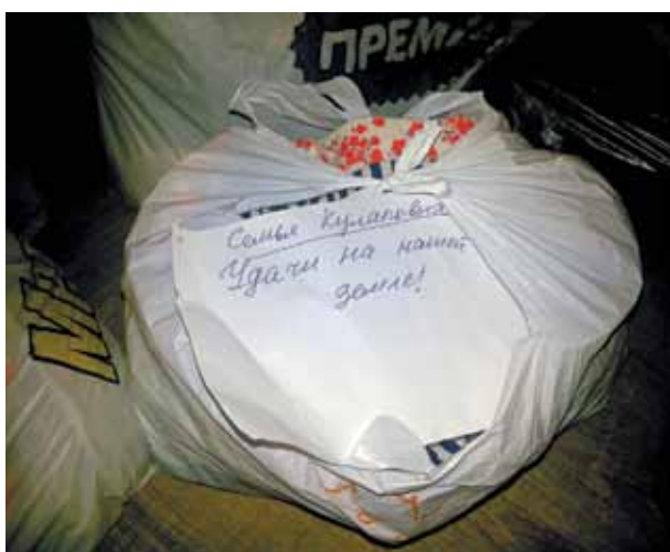
“Good luck on our land!” A message from a local family in Khmelnytskyi to a family from Crimea

As the situation in Crimea and several Eastern regions of Ukraine remains fragile, Ukrainian authorities as well as the international community stepped up their preparedness planning. IOM actively participated in the activities of the UN Disaster Management Team, and also has been engaged in preparatory measures with partners such as UNHCR, UNICEF and WHO, including movement monitoring, joint field and desk assessments, and initial gaps analysis.